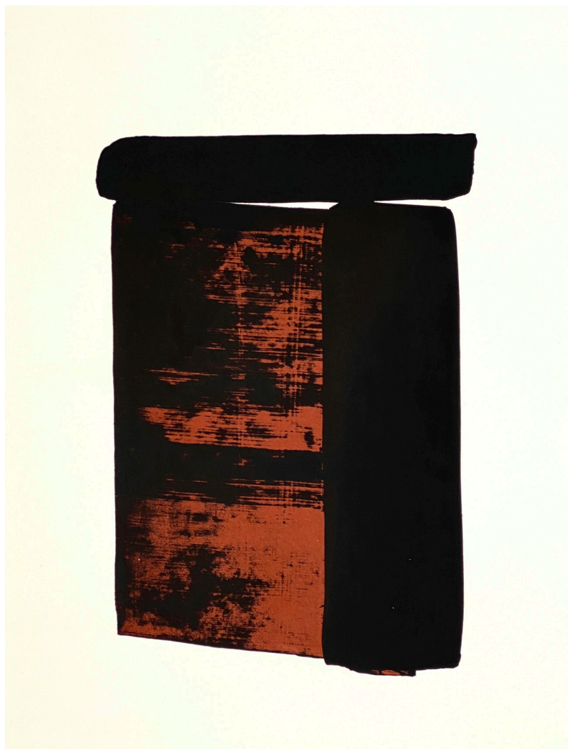
Pierre Soulages, Sérigraphie n° 12, 1979