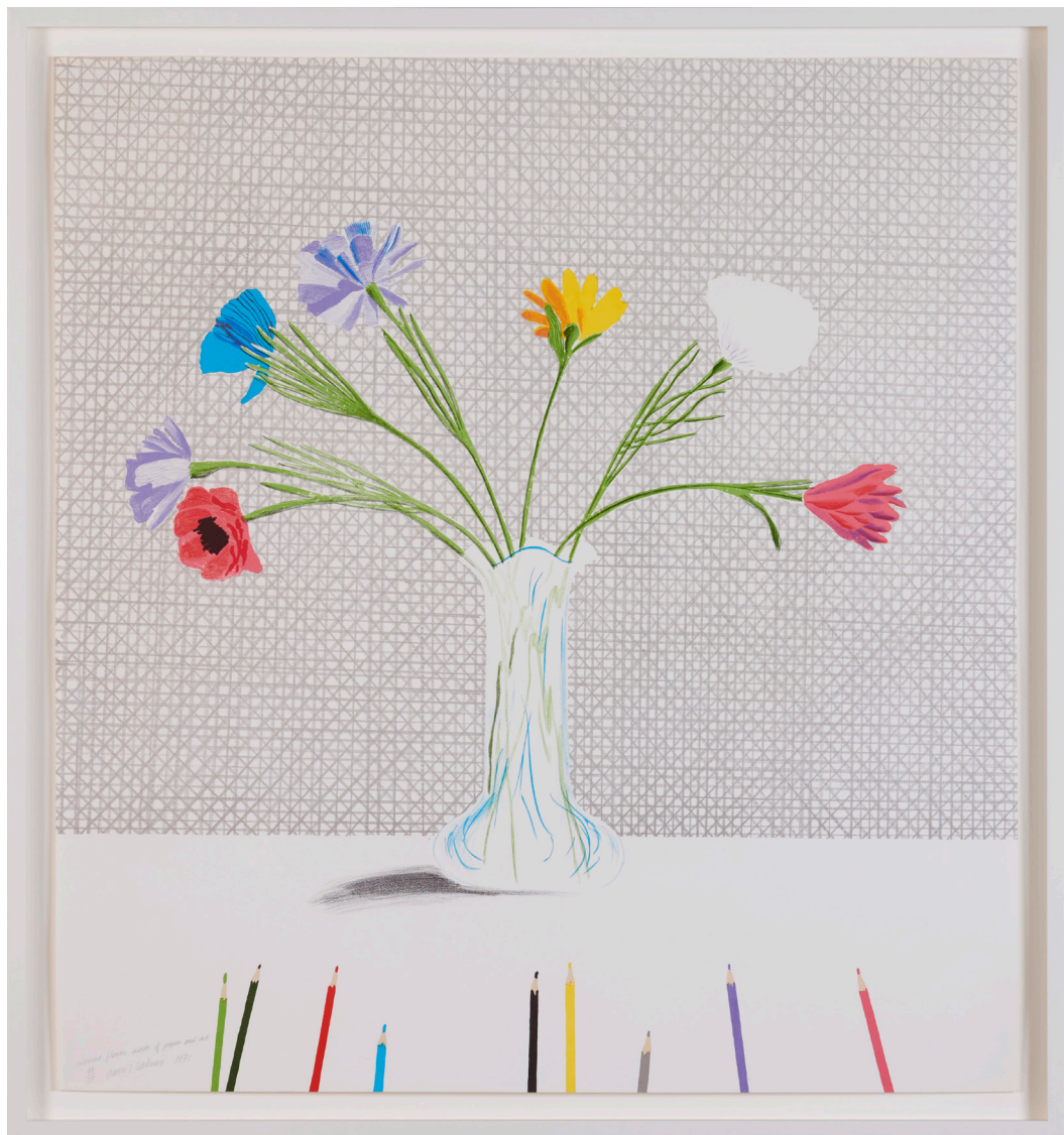
David Hockney, Coloured Flowers Made of Paper and Ink, 1971